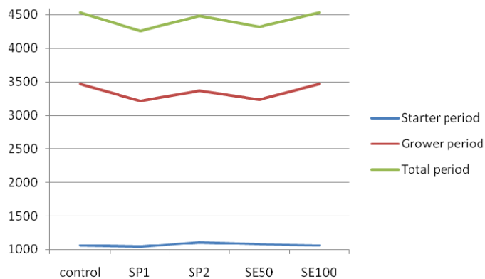
Figure 1: Feed intake of Ross 308 broilers at starter ( \pm 26.6 ), grower ( \pm 60.2 ), and total ( \pm 62.8 ) periods (gr/chick/period)

Control group: standard diets ; SP1: diets supplemented with 1.0% savory powder; SP2: diets supplemented with 2.0% savory powder; SE50: drinking water supplemented with 50 ppm savory extract; SE100: drinking water supplemented with 100 ppm savory extract.