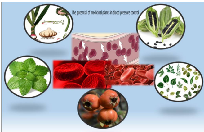
Figure 1. The potential of medicinal plants in blood pressure control

The present study aimed to investigate the effect of secondary metabolites of Iranian medicinal plants in the treatment of a wide range of diseases, including hypertension and heart attacks, through their effects on transcription factors and signaling pathways (Figure 1).